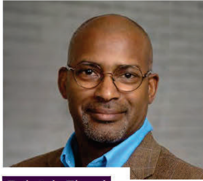
Raleigh Floyd Media Relations